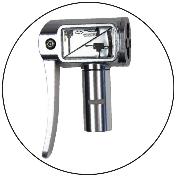
Proprietary High performance pump head